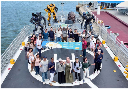
Boarding Marine Ship

With considerable difficulties stemming from the global Covid-19 outbreak, NPUST's Office of International Affairs encouraged the university's 600+ overseas students to stay in Taiwan over the summer break and enjoy their time spent on the island. To give the students an eventful and memorable summer, a series of activities were planned over the two-month recess .