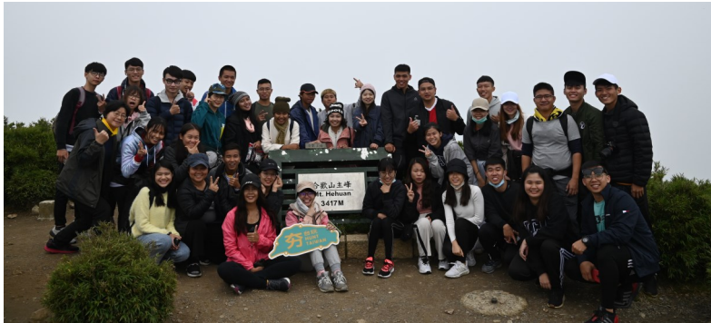
Climbing to the top - Mt. Hehuan

With considerable difficulties stemming from the global Covid-19 outbreak, NPUST's Office of International Affairs encouraged the university's 600+ overseas students to stay in Taiwan over the summer break and enjoy their time spent on the island. To give the students an eventful and memorable summer, a series of activities were planned over the two-month recess .