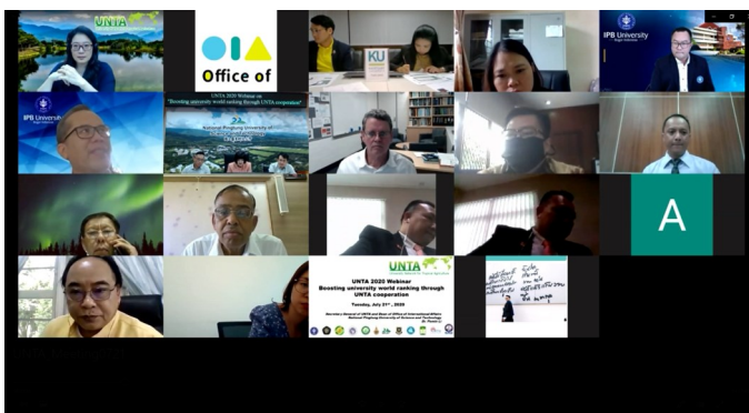
A Clip of participants

From there, meeting participants began discussing ways in which to create new opportunities for UNTA members to grow and develop together. The underlying principle is that by pursuing common interests and leveraging resources to achieve common goals, partners have a real chance to make an impact and contribute more to the conversation.