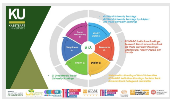
KU- 6U Model

4) University Rankings Committee. There is a university rankings committee that meets on a regular basis to monitor and evaluate the readiness of data prior to submitting data to the collection portal.