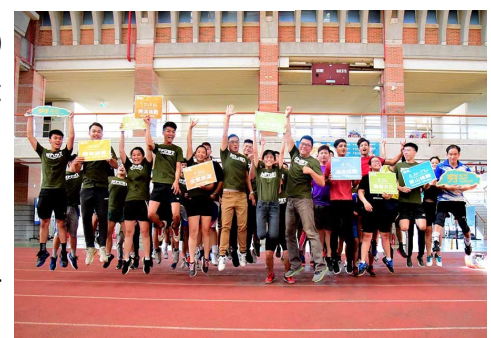
Opening activity of Hunt Taiwan

With considerable concern stemming from the global Covid-19 outbreak, NPUST’s Office of International Affairs held an event designed to encourage students to stay in Taiwan over the summer break. Divided into 8 major themes, the “Hunt Taiwan” activity ran from July 10 to August 27 and gave students a chance to experience Taiwan in a new and exciting way. - Continued on p.9