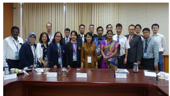
Assembly meeting in 2019

Since 2018, the Secretariat has been organizing the “UNTA Bilateral Faculty Exchange Program” to promote deeper cooperation between partners. Through the program, NPUST has already hosted more than 30 faculty members and graduate students affiliated with 17 bilateral projects. So far, the main focus of these has been placed on food science, animal science, plant medicine, aquaculture, biological science and technology, civil engineering and biomechatronics engineering.- Continued on p.8