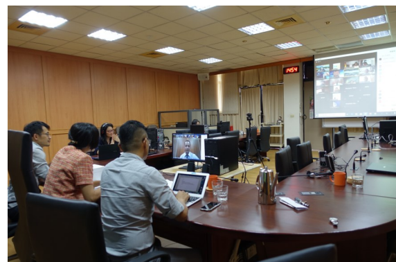
In the meeting