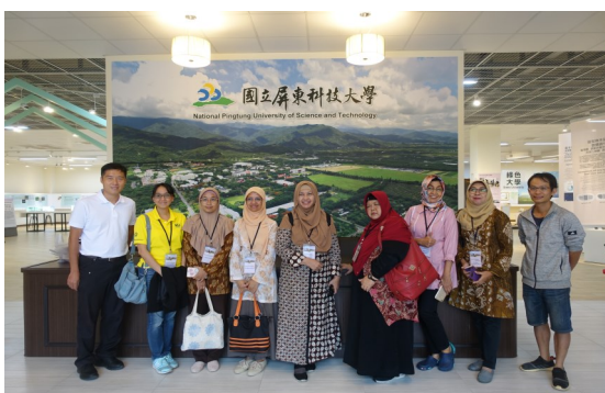
Campus tour and assembly in 2019

https://unta.npust.edu.tw/category/topic/